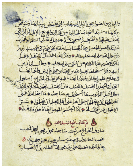
Figure 1: Page from old copy of Nahj Al-Balagha

During his reign, Ali would deliver a total of more than 800 sermons, epistles and short sayings. These writings were considered at the peak of Arabic eloquence... and they would be compiled half a century after Ali's death into an anthology known as Nahj al-Balagha.